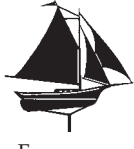
FRIENDSHIP SLOOP 958