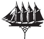
4 MAST SCHOONER 954